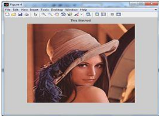
Fig 5: Super Resolution