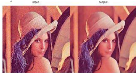
Fig 4: Iterative technique

High-resolution image, synthesize from the low-resolution image. Output is based on nearest neighbor in image resampling. In contrast to bilinear interpolation, images resampled with bicubic interpolation are smoother and have fewer interpolation artifacts.