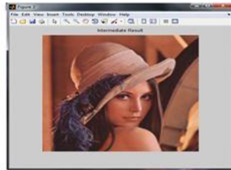
Fig 3: Intermediate Result

Intermediate result is an enlarged image compared to the input image with less clarity. So further apply bicubic interpolation to the intermediate result.